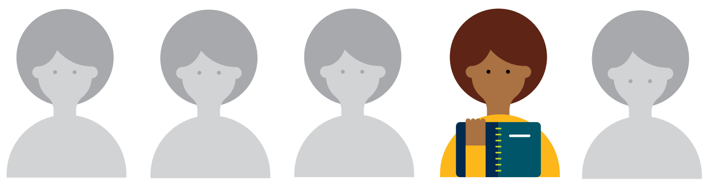
Copyright © 2019 NCS Pearson, Inc. All rights reserved.

Evaluators are advised to assess other skill areas as well to identify additional areas of strength and weakness in the individual's learning profile. For example, assessing skill levels in the areas of math (computation, problem solving, and fluency) is recommended because a subset of individuals with dyslexia experience math difficulties as well.<sup>18</sup> In addition, assessing vocabulary and grammar (morphological-syntactic) skills is important for understanding whether a more pervasive oral and written language disorder may be contributing to literacy difficulties.<sup>3, 37</sup>